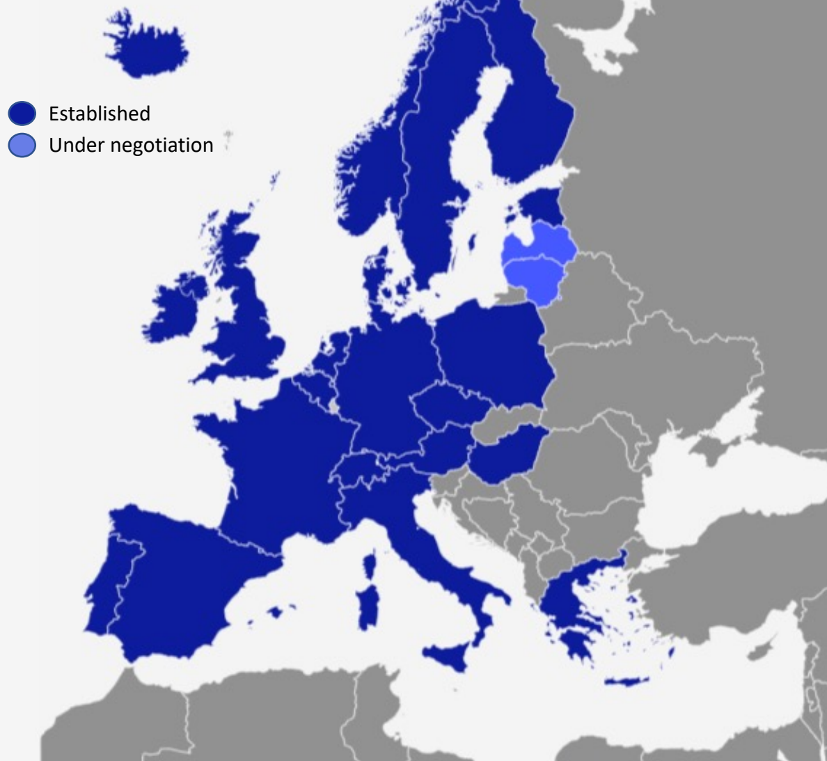
Map of the National networks